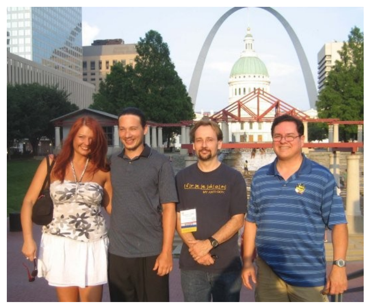
Our Delegates In St. Louis

Sunday, August \tilde{8} 1:00 PM Steering Committee Meeting at Tumulty's in New Brunswick.