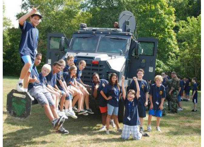
Armored car in use in Somerville, NJ

The Gloucester Township Municipal Council recently solicited for bids for the purchase of an armored vehicle. Only one bid for $277,986 was received.