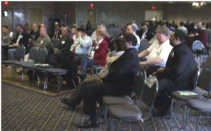
Members fill the meeting room to hear speakers.