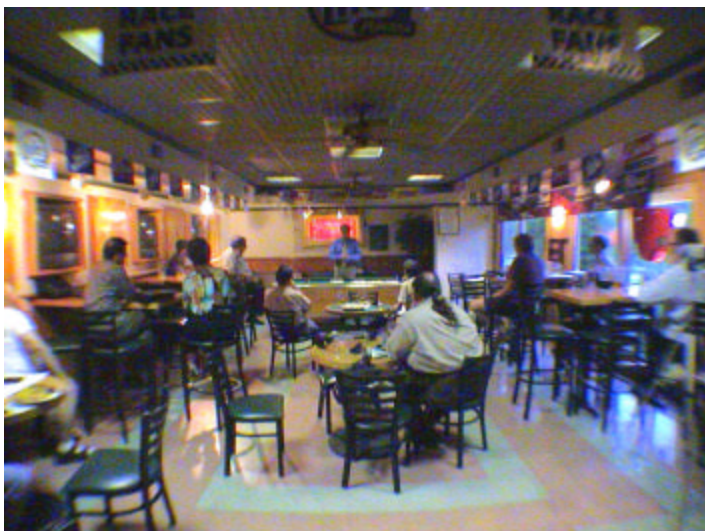
Left: Wide-angle photograph, taken from the rear of the Riverside Pub's auxiliary dining area / meeting room. In foreground, Ed Crisonino gives his speech