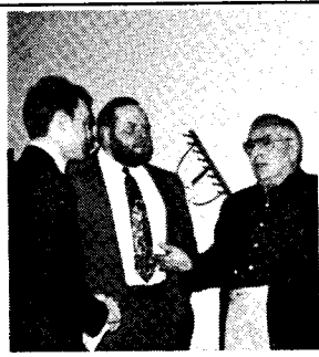
Derby, Ponczek, Homer

Homer drove home the point that the government is hurting the average Ameri-