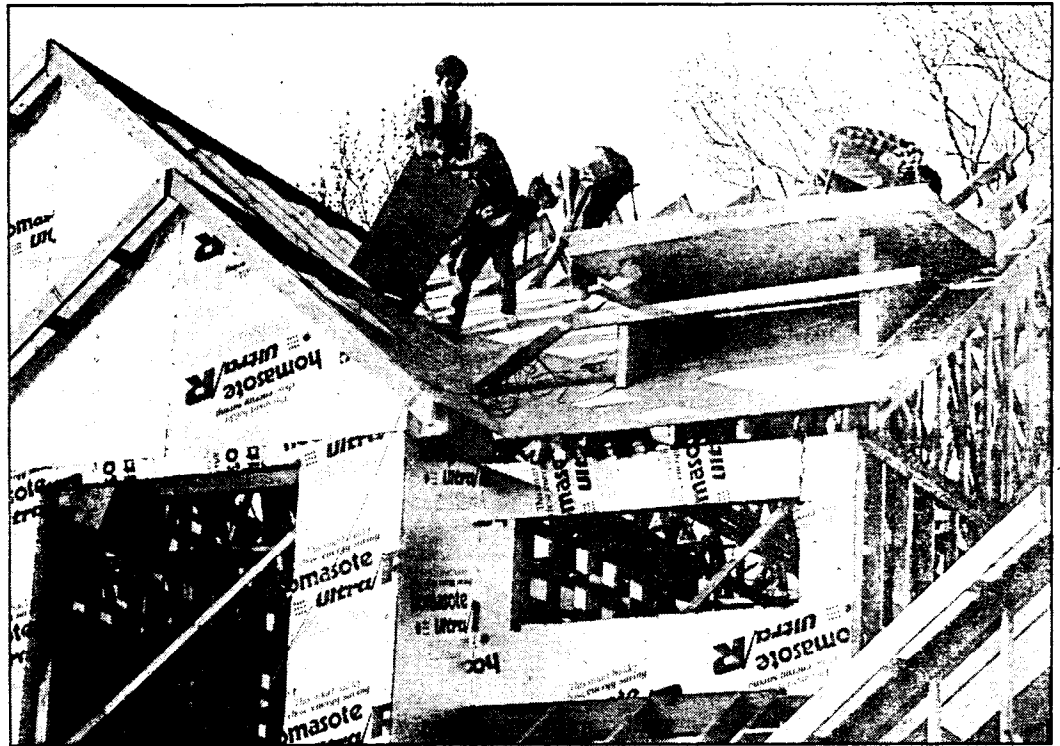
The News Tribune

New home construction: Does it include homes for the homeless?