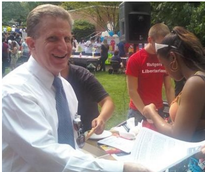
"People were happy to meet me."

Thousands of students passed the table and many took copies of the Bill of Rights and Constitution, or books about their free speech rights on campus. I handed out more flyers about my positions on the issues than at any other campaign stop so far. I also walked around and gave some of that literature to students manning tables for two gay rights groups and a women's political activism group, and I was very well received.