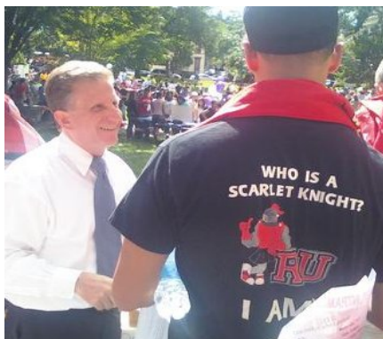
Thousands of students showed up.