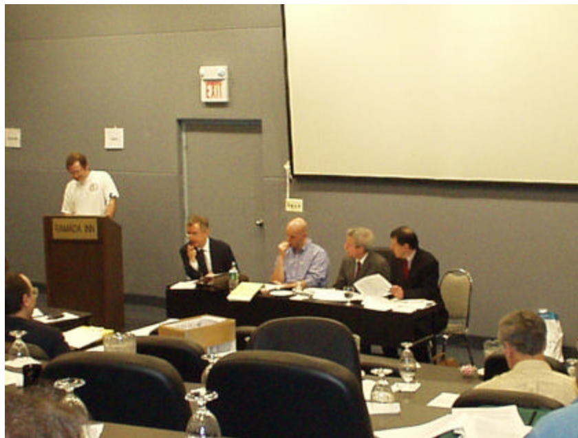
Members at Work... The Annual Convention addresses election of officers, selection of candidates and bylaws questions.